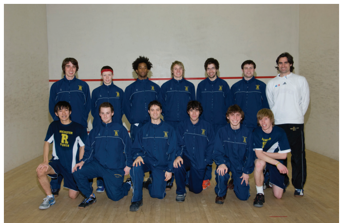
2007-08 Squash Team